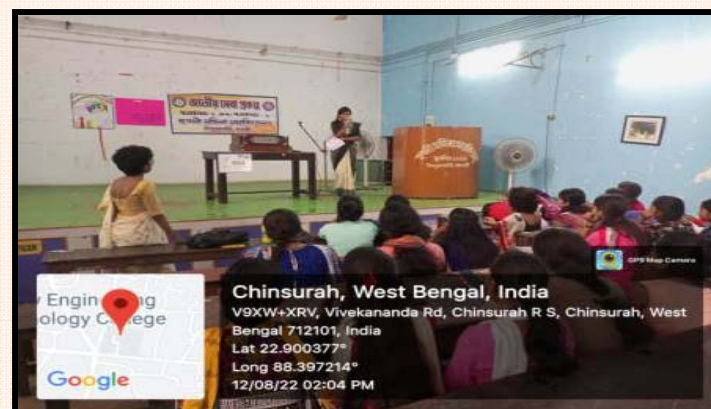
Debate and Discussion