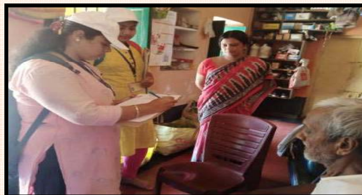
NSS Volunteers participating in social survey in adopted village